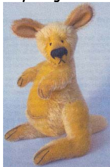
by Ilze Linssen