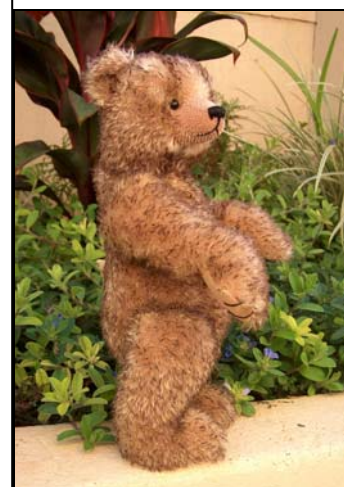
Zenako Design 2005 © by Eunice Beaton